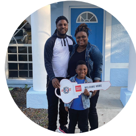
RENT & MORTGAGE